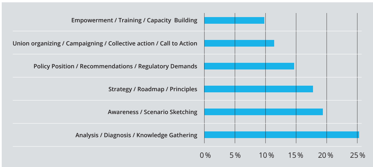
Image 2: Percentage distribution of the contributions that trade unions achieve in their activities on algorithmic transparency and accountability in work-related contexts..

Reflective contributions dominate in this sample. The highest numbers in this sample can be identified as contributions on doing analyses, raising awareness, and formulating strategies and principles. More concrete and implementation-oriented contributions like formulating policy position, campaigning on algorithmic transparency, and accountability or empowering worker and worker representatives through specific capacity-building initiatives happen at a much lesser scale. There is a need to promote the more hands-on implementations over the more reflective contributions.